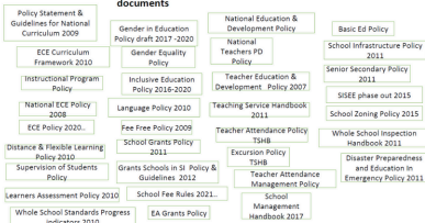
A sample of existing 'policy' documents

Emphasising the importance of vernacular education from ECE to Year 4, there's a call for MEHRD to improve vernacular curricula. Additionally, the integration of culture and indigenous knowledge into the curriculum from an early age is encouraged, with financial support for cultural teachers. With limited formal employment opportunities, the government is urged to increase support for Rural Training Centres (RTCs) and modernise their curriculum to include technology and income-generating studies. Lastly, the MEHRD is encouraged to collaborate with COESI and other NGOs, utilising the Gender, Age, Place, Socio-Economic, Ethnicity and Disability (GAPSED+) equity framework in policymaking and programming.