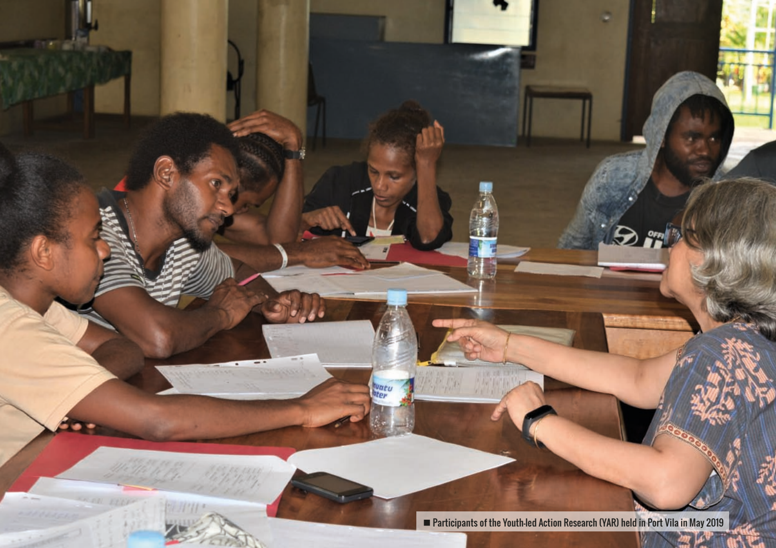
■ Participants of the Youth-led Action Research (YAR) held in Port Vila in May 2019