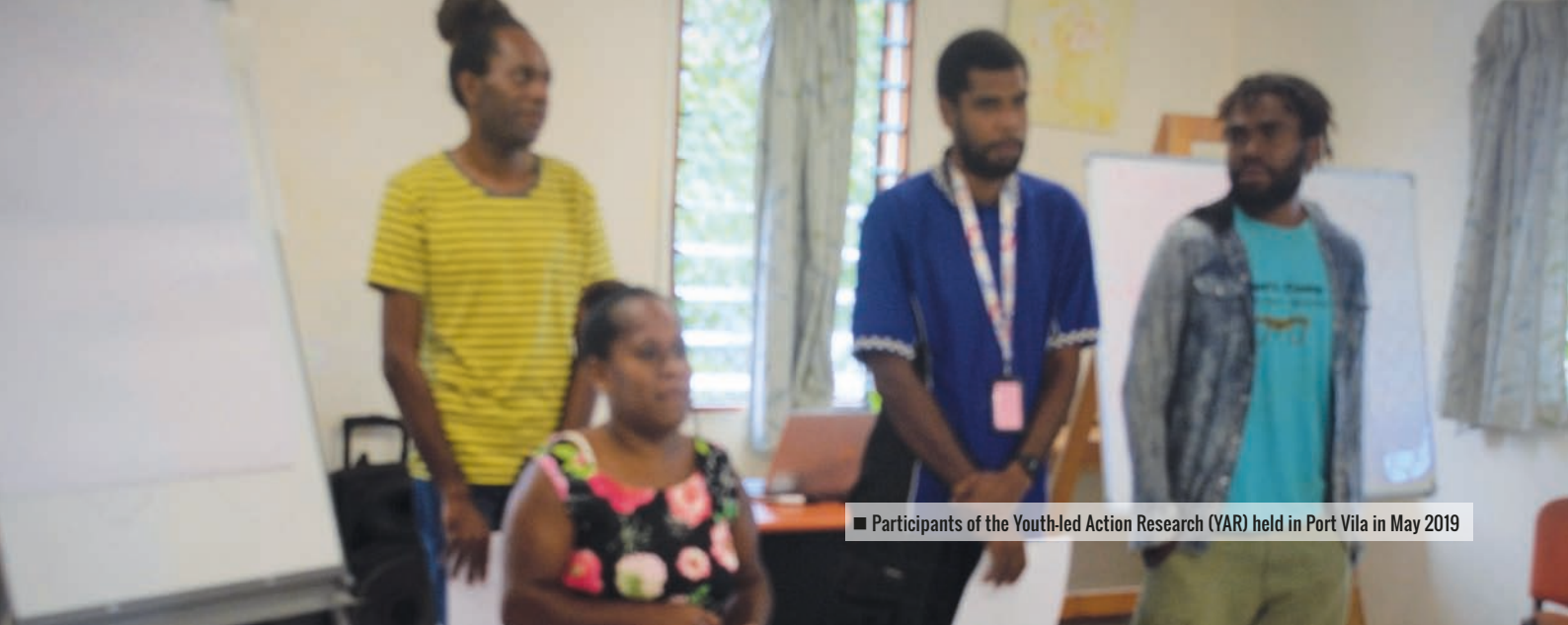
■ Participants of the Youth-led Action Research (YAR) held in Port Vila in May 2019

Training policy will hopefully improve this sector and strengthen the pathway between education and work, informed by the actual demands of the informal and formal job markets.