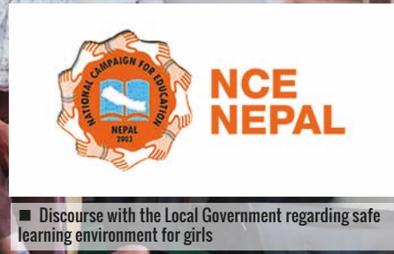
■ Discourse with the Local Government regarding safe learning environment for girls