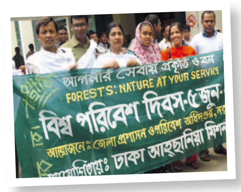
Celebration of World Environment Day

The early marriage of girls in rural areas, especially among poor families, represents another significant social problem. These girls are forced to end their schooling and become mothers at an early age – many suffer poor health throughout their lives as a result. I began to work on raising awareness among impoverished families of the consequences of early marriage. My work in this area is ongoing.