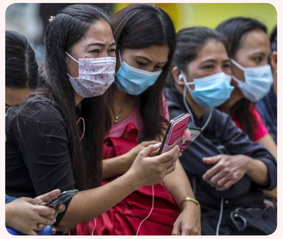
It is imperative that the public is equipped with media literacy skills, especially when receiving forwarded materials and information.

are not rigid and will not restrict them within the compound of the syllabus. This would be beneficial in inculcating critical thinking from a young age, making stduents less susceptible to