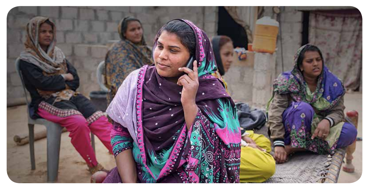
Learners from rural and remote areas, ethnic, religious or linguistic minorities, girls and women, Dalits, learners with disabilities, migrants, and adult learners continue to face obstacles to accessing online education and learning.

learning and blended learning. Other forms of technology, such as radio and television, and the delivery of paperbased learning materials or offline content, are also used to implement distance education. Countries are also considering adjusting or reducing the curriculum content and deploying remedial accelerated learning programmes so learners will not be overloaded academically and psychosocially.