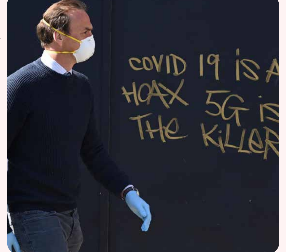
Society was thrust with disinformation and misinformation that could be viewed to be as dangerous as COVID-19 itself.

During this difficult period, society was thrust with disinformation and misinformation that could be viewed to be as dangerous as COVID-19 itself. For instance, prior to the lockdown announcement in Malaysia, WhatsApp and Facebook were used as a medium to spread distressing messages that the country may be faced with shortages in terms of food, medicinal supplies, and basic goods. These unwarranted calls of distress caused panic