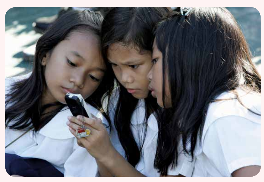
The government should consider the prospect of introducing digital literacy skills, at least starting from secondary school, as the young generation today are exposed to technology at an early stage of their life.

to fact checking news and information), to provide accurate information to the public and to counter fake news. The government should also encourage the general public to utilise platforms like this to double check that the information they received is accurate. However, it is essential for them to ensure that such platforms are not abused for their personal gains.