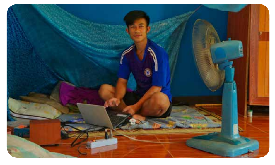
The Youth Action Research group's recommendations included promoting local education and training, especially at the village level, and equipping teachers with sufficient knowledge and skills on information technologies and distance education.

• Ensure that education is a public good and that the state performs key responsibilities, including ensuring access to an online platforms for