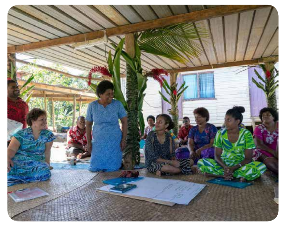
Lack of access to online learning has also negatively affected skills development training. Community learning centres are either closed and or are running with very little or no financial support.

facilities, but also to electricity connections. Even low-tech solutions through radio and television have not been viable for them. The youth researchers have recommended that physical learning materials (books, handouts) are still the most viable medium for teaching and learning in most of the rural areas. For areas where internet conectivity is available, they come at a high price. Access to free interent services will be especially