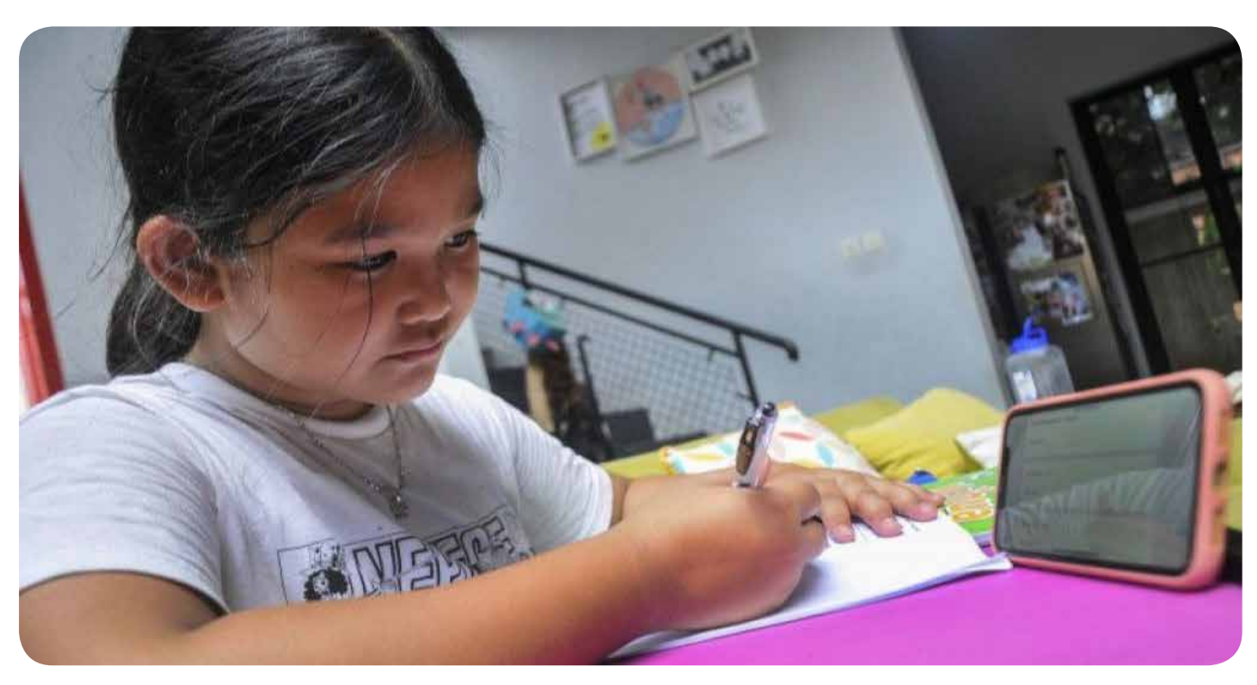
ASPBAE calls on governments, development partners, and the global community to ensure free and open access to appropriate technologies and tools that facilitate distance learning and community-based learning programmes.

heightened influence of these companies in the provision of education and their agenda to position themselves at the "centre of essential education services", not merely as a response to the current crisis, but for the long-term.