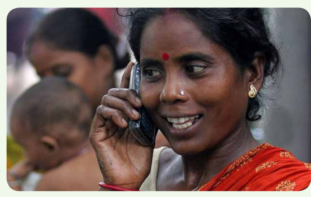
In times of COVID, technology, digital tools, and the ability to operate them have almost become survival tools for marginalized people to access their rights and entitlements.

Applied Digital Literacy (AppDiL): An Integrated Digital Literacy Programme was conceived by Nirantar in response to the changing educational needs of women in context of their livelihoods and new forms of knowledge essential for women's empowerment in the current context. Work on AppDiL, combining literacy and digital literacy work,