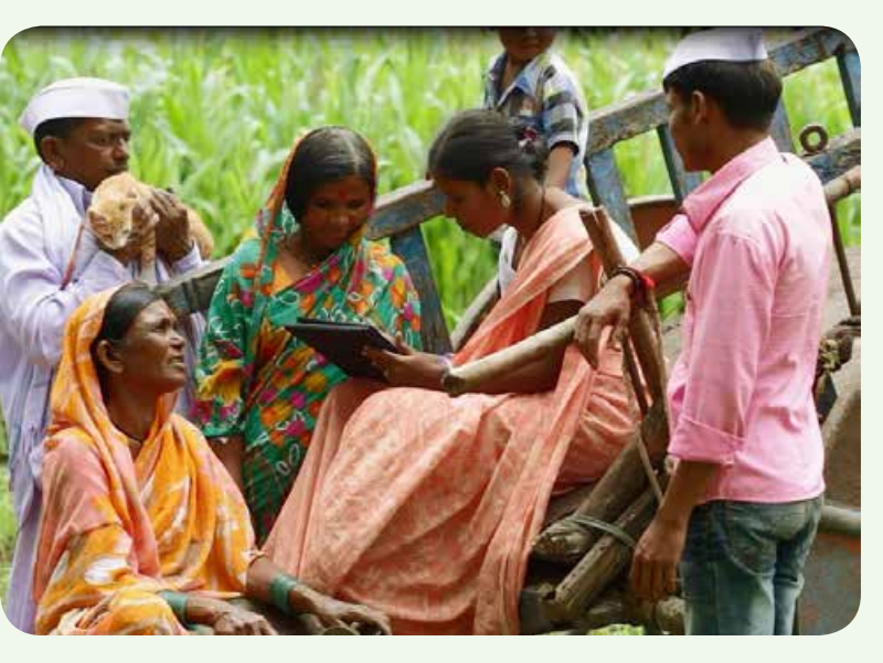
Applied Digital Literacy (AppDiL): An Integrated Digital Literacy Programme was conceived by Nirantar in response to the changing educational needs of women in context of their livelihoods and new forms of knowledge essential for their empowerment.

Asia South Pacific Associatio for Basic and Adult Education Learning Beyond Boundarie