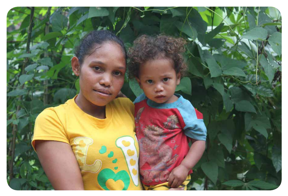
For countries with low learning outcomes, a large number of school dropouts, and insufficient infrastructure, the impact of COVID-19 on education will be far more negative. Marginalized groups will be excluded from learning opportunities.

The shutdown of schools and colleges has affected millions of poor students, and evidence suggests that for countries with low learning outcomes,