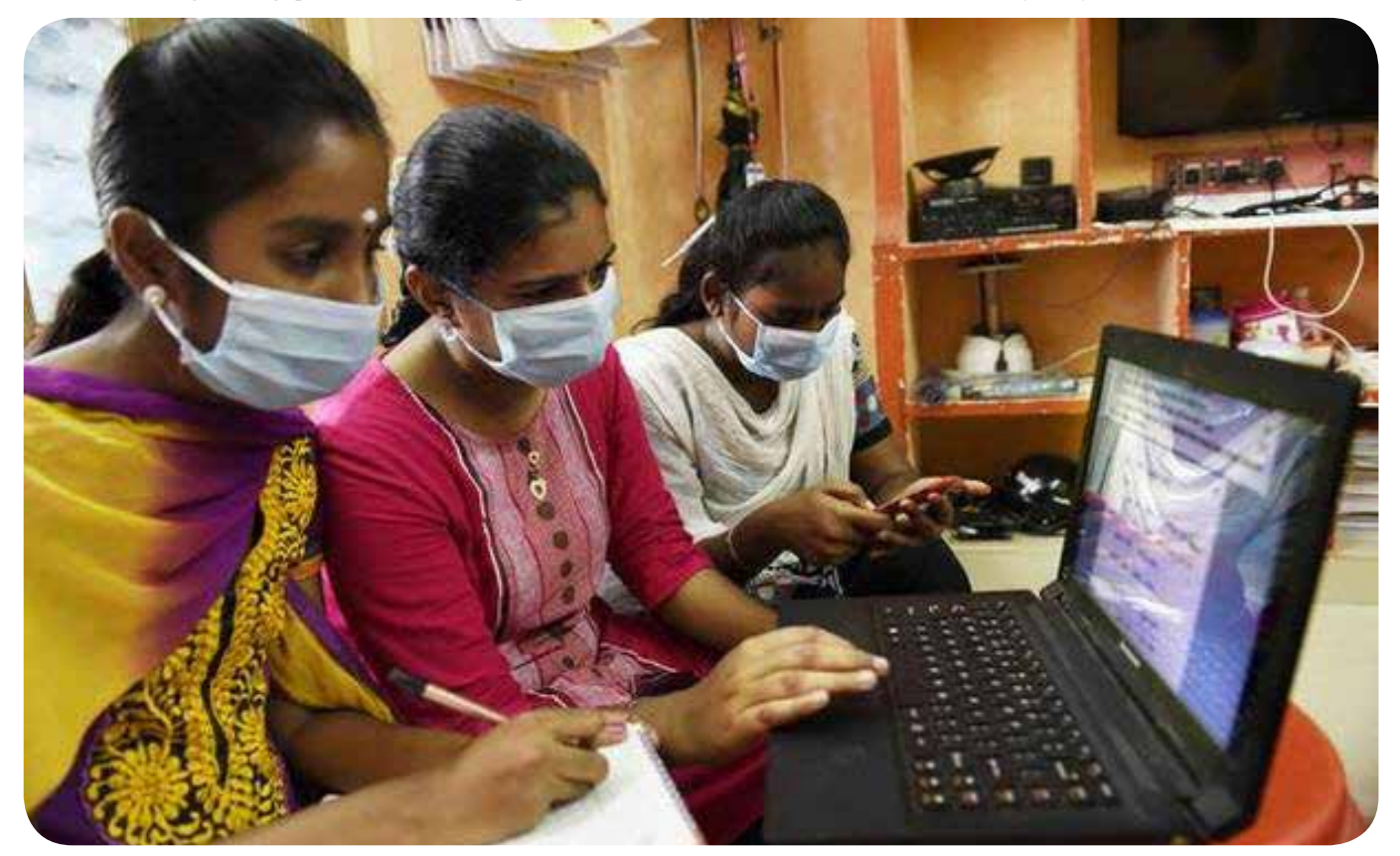
Equipping all learners, particularly girls, women, and adults with the necessary digital skills will open more meaningful opportunities for knowledge and skills development.

Alongside the rise of online and distance learning solutions are private actors, including education technology companies and major corporations, that capitalize on the shift towards online and distance learning strategies. The recent report of Education International (2020) raises concerns about the