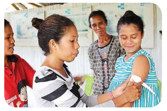
Education plays a fundamental role in the success of the SDGs as it directly contributes to fighting poverty, ending inequalities, and promoting health and nutrition.

Even though education (SDG 4) is not under specific review in 2017, it is important to recognise in the review process the strong links between education and the given goals, recognising that education is key in meeting many of the most important development challenges that exist today. Education plays a fundamental role