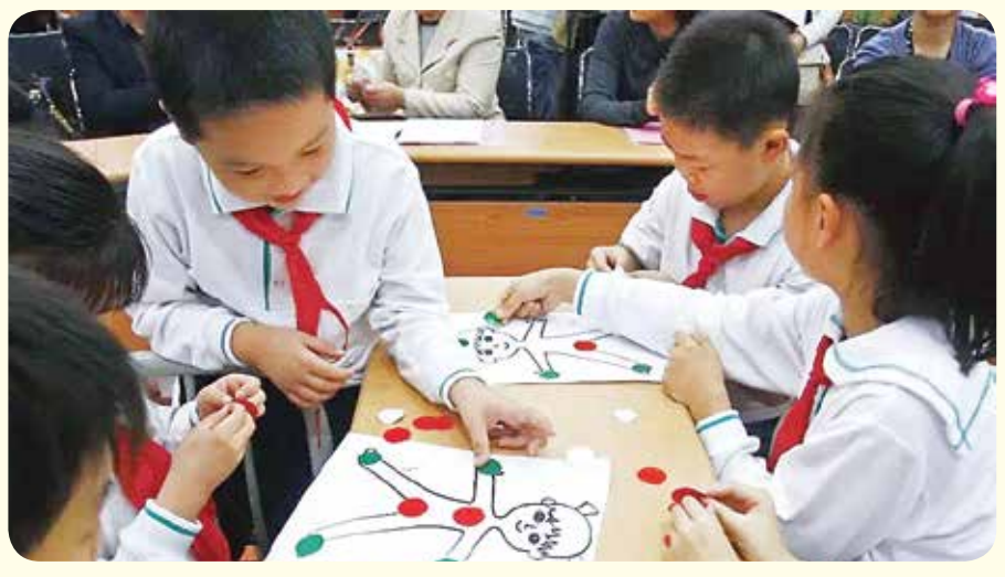
Creating an understanding of patriarchy, gender, power dynamics, and human rights is essential for sexuality education curricula to be truly effective.

There has been huge outrage expressed by different stakeholders, ranging from governments and parents to even teachers, over inclusion of comprehensive sexuality education in the school curricula, especially the rights-based components on sexual diversity and desire. It is important to ask how this silencing and exclusion of sexuality education contributes to promotion and prevalence of sexism, gender inequality, rape culture, unhealthy attitudes towards sex and towards their own bodies, and what our alternatives are if we are so hesitant towards imparting this knowledge to our children.