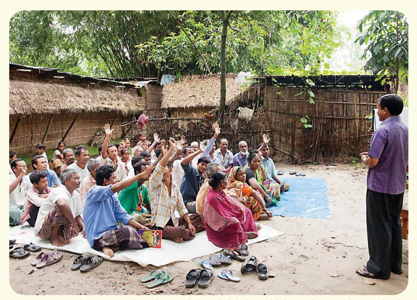
Community Learning Centres are an effective learning platform which facilitate adult learning because of their roots based in communities and flexible learning processes.

Typically, in these examples, the farmers are 'learners' and extension personnel are 'teachers'. The learners learn at their own pace as per need and convenience. Are adult learning and education proponents ready to call this an education programme and transform traditional adult learning and education programmes accordingly? This is an essential requirement to brand education as vital to the Sustainable Development Goals.