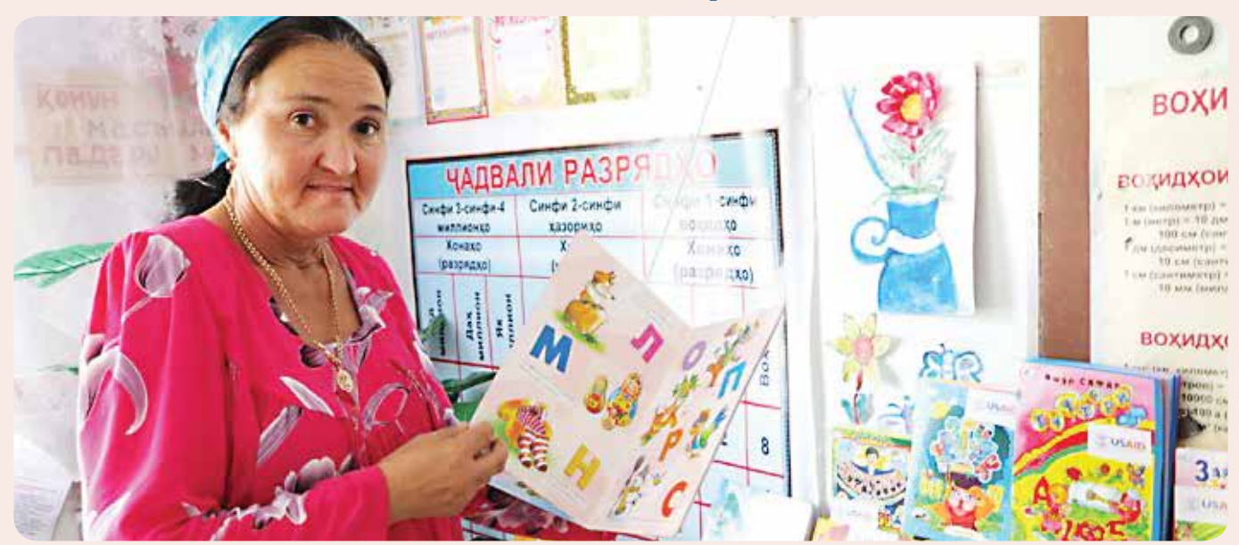
SDG financing has proven challenging. Domestic budgets remain insufficient and reductions in ODA have not helped.

Linkages between education and the 2030 Sustainable Development Goals