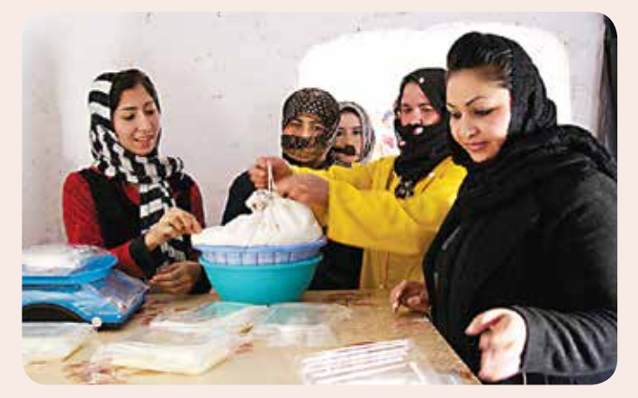
Regarding SDG 5, achieving gender equality requires an approach which ensures that girls and boys, women and men not only access education and training, but are also empowered equally in and through education and lifelong learning.

• Countries must ensure that levels of domestic funding for education are in line with the international