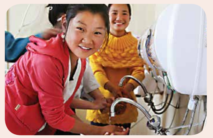
Education is one of the most powerful ways of achieving SDG 3 on health and of making sure the benefits are passed on to future generations.