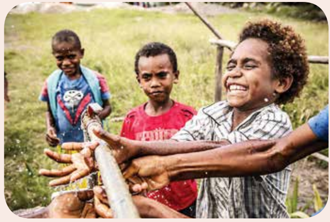
Free, quality education breaks cycles of poverty and exclusion, making SDG 4's commitment to universal, free, primary and secondary education vital.

- as embedded in the SDGs themselves. A further challenge lies in the measurement and accountability processes. The global indicators framework is not yet finalised, delaying the collection of stronger, disaggregated data which is critical to ensuring that the SDGs deliver for the most marginalised. Civil society can contribute here, with citizencollected data. However, several proposed education indicators are reducing the agenda to measures of testing, which fails the ambition of SDG 4 to deliver quality education, and of all the SDGs to ensure that everyone enjoys fulfilling lives.