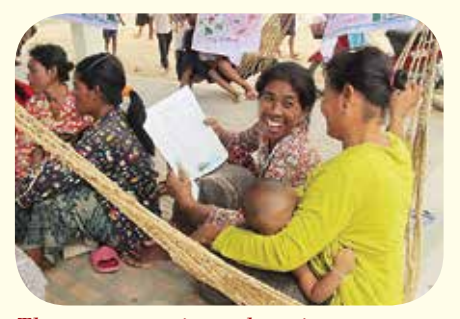
The community learning centres established in Cambodia by Shanti Volunteer Association (Japan) focus on improving the daily life of each community member by linking literacy classes with livelihood workshops providing basic knowledge and skills.

Though it is challenging to set statistical indicators for "non-cognitive life skills", civil society organisations can play an important role in compiling qualitative date from field experience. This would strongly contribute advancing "lifelong learning", to providing continuous learning opportunities and various forms of education to equip people with the capacities they need to combat poverty and inequity, improve their lives and well-being, contribute well to society, and participate in defining a more sustainable development path.