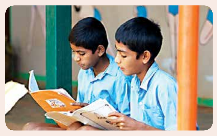
Policies must support the provision of a complete cycle of quality secondary education for all.

This write-up is based on information appearing on the HLPF website and on the Education and Academia Stakeholder Group and SDG-Education 2030 Steering Committee submissions to the HLPF.