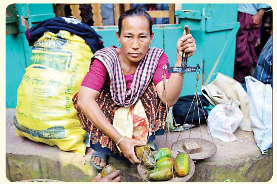
In DAM's livelohood and training programmes, farmers are offered access to market information and enhanced negotiating skills.

Besides productivity enhancement, the learning domain of farmers is extended to marketing education, enabling them to access market information and enhance their negotiation skills, diversifying their business opportunities, and employment and entrepreneurship development, which are common targets in SDG 1, 2, 4 and 8.