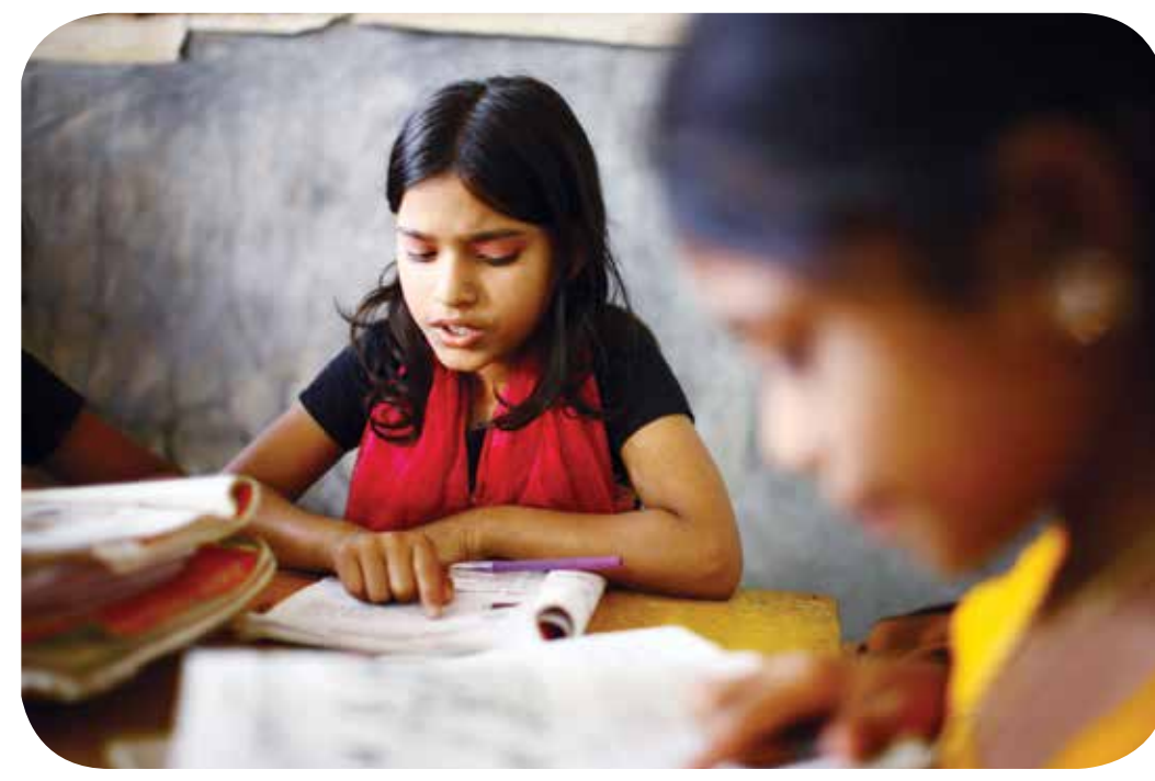
The Global Monitoring Report (GMR) calculated there would be 171 million fewer people living in poverty if all students in low income countries learnt basic reading skills.

years later, compared to households with no schooling. Education, along with other investments, can help in reducing poverty, particularly among disadvantaged children in rural areas and among minority groups.