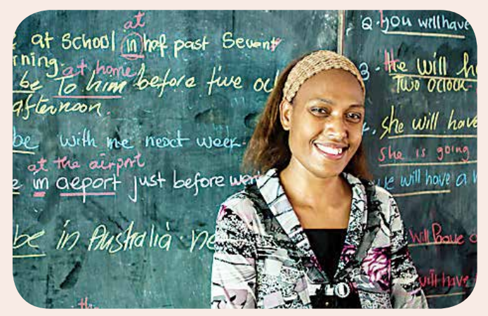
The Education and Academia Stakeholder Group and the SDG-Education 2030 Steering Committee provided their submissions to the HLPF 2017 on SDG 4 as education interacts and relates to the Sustainable Development Goals under review.

Free, quality education breaks cycles of poverty and exclusion, making SDG 4's commitment to universal, free, primary and secondary education vital. A 12% cut in global poverty could be achieved if all students in low income countries have basic reading skills. Education addresses discrimination against women and girls, and when women are educated, nutrition, food security, child health and mortality are improved. If all women complete primary school, maternal deaths