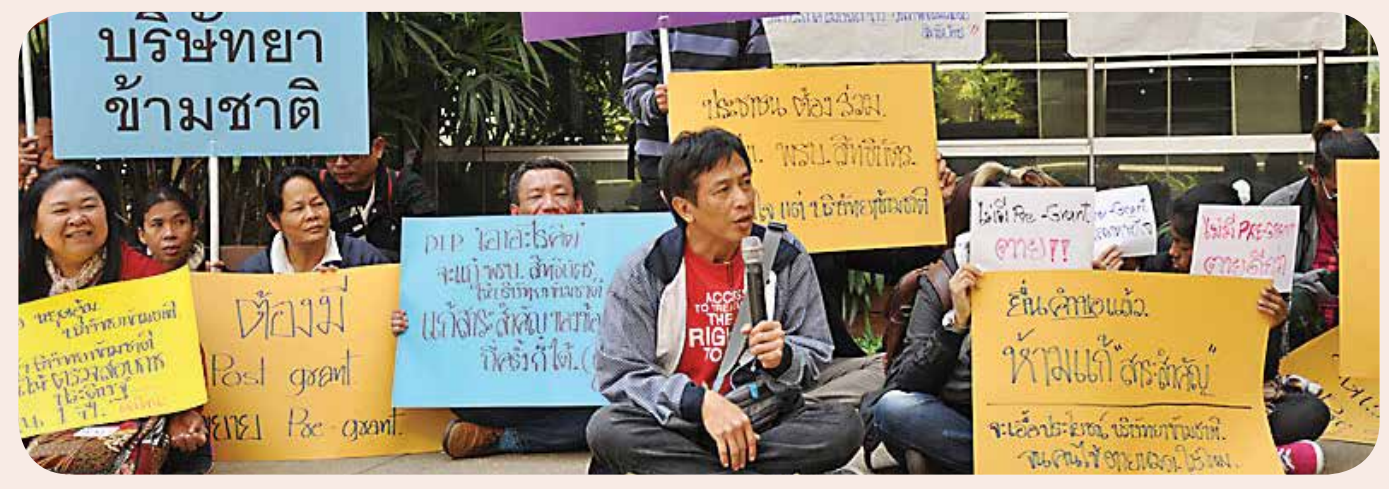
Despite the participatory climate in which the SDGs were developed, many doors have since closed to civil society.

Improved education attainment and learning achievement increase the earning capacity of individuals and the economic growth of nations, which in turn help reduce poverty. The importance of public expenditure on education (alongside health and social protection) as a percentage of total government expenditure is reflected in its selection as a global indicator under SDG 1. Research and development in agriculture is key to achieving food security and sustainable practices; likewise, education, particularly for women, is an essential ingredient of improved nutrition - both of which come under SDG 2. Education is one of the most powerful ways of achieving SDG 3 on health and of making sure the benefits are passed on to future generations. With respect to SDG 5, achieving gender equality requires an approach which ensures that girls and boys, women and men not only access education and training, but are also empowered equally in and through education and lifelong learning. Good quality education also holds the key for innovationled economic growth, one of the objectives of SDG 9. In addition to education's role in the achievement of specific SDGs, schools, universities, and the education sector more generally, have a critical role to play in raising awareness of Agenda 2030, and to galvanise commitments by teaching about the SDGs, undertaking research on sustainable development, and supporting local sustainability efforts.