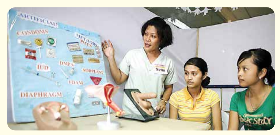
An education curriculum with comprehensive sexuality education is the most holistic pathway to fight gender inequality and impart skills and knowledge into children for a healthy transition into adulthood.

sia Pacific is home to the largest youth population (aged between 15-24 years) in the world. One in seven girls in the region has given birth by the age of 18, often in the context of high unmet need for contraception and child marriage, with more than a third of girls married before their 18^{\text{th}} birthday. Up to 63%of adolescent pregnancies in the region are unintended, contributing to a significant, although underreported, burden of unsafe abortion<sup>1</sup>. According to a study, about up to 10% of males and 20% of females report having had a sexually transmitted infection or symptoms in the last 12 months<sup>2</sup>. Less than a third of young people have comprehensive knowledge of HIV and the majority (95%) of new infections occur among young key populations, including young female sex workers, men who have sex with men,