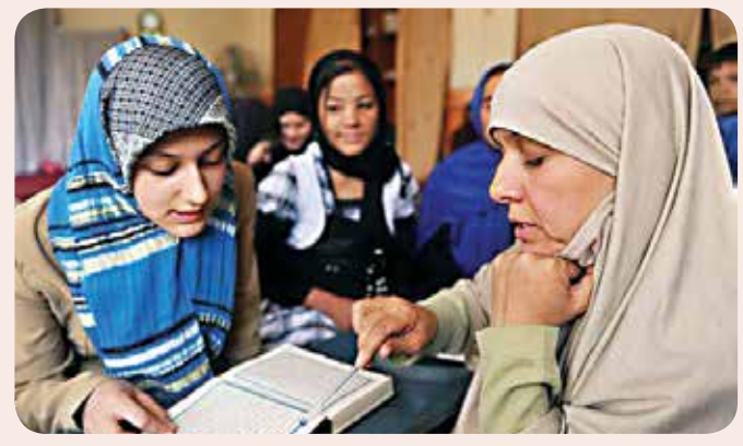
To ensure education is more equitable and focused on the most disadvantaged, learners will require changes in the design of education systems, practices in and out of school, and in the way in which resources are allocated.

benchmarks of at least 15% of public expenditure and 4% of GDP as outlined in the 2015 Incheon Declaration and the Education 2030 Framework for Action.