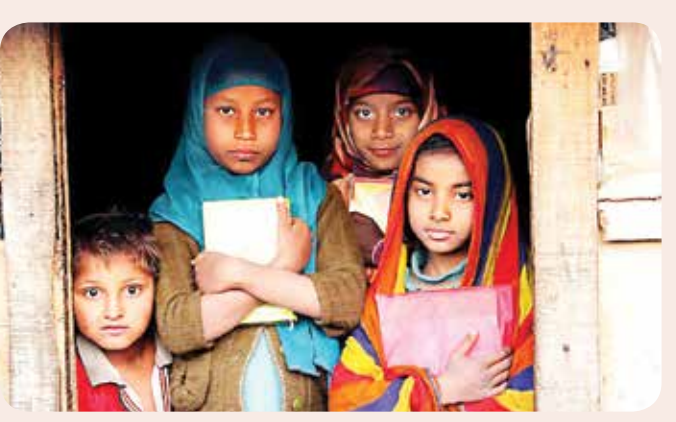
Education systems that receive forcibly displaced children and youth need to adapt to support their long-term integration.

Ph: + 91 (0) 9811699292 (New Delhi, India) Email: medha.aspbae@gmail.com • Website: www.aspbae.org