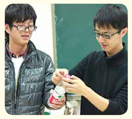
Exclusion of sexuality education silences and stigmatises any discussion on bodily changes, on positive body images, on managing transition into adulthood, on sexuality and relationships and desire, and on gender norms and attitude.

Yet, comprehensive sexuality education remains a much contested issue all over the world. There are divided opinions on whether sexuality education should be imparted to children and, if yes, to what extent and what range of issues should be covered in sexuality education curriculum<sup>10</sup>.