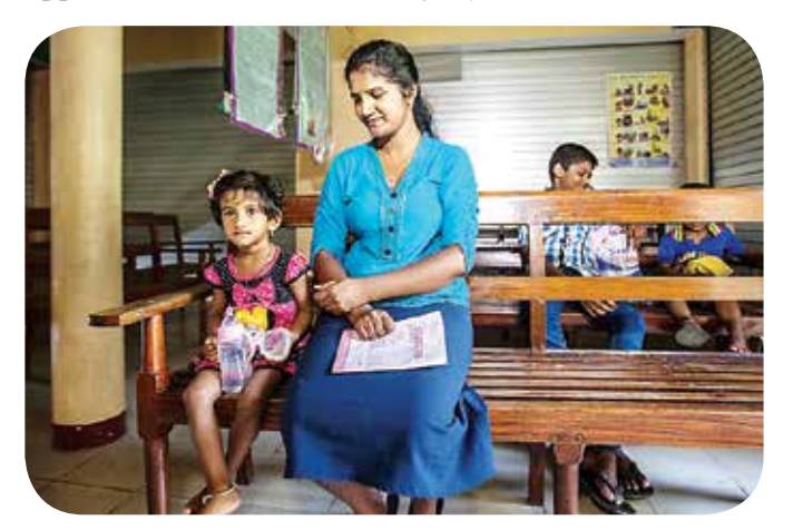
Educating girls can save millions of lives. A literate mother is more likely to be better informed of specific diseases, thus take measures to prevent them.

This issue of Ed-lines especially highlights experiences on youth and adult education practice and how these impact on the fight against poverty, in advancing gender justice, promoting health, and improving livelihood opportunities for lives with dignity.