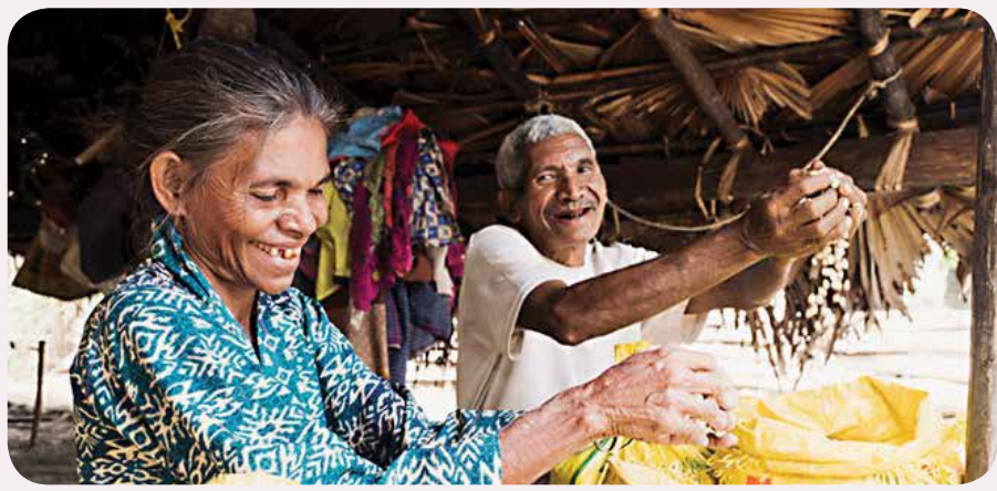
The duty bearers around citizens, from both public and private sectors, are diverse and shoulder the responsibility of preparing youth and adults to be active contributors in relevant disciplines.

along with governments, have already committed to sharing the responsibility so that 'no one is left behind'.