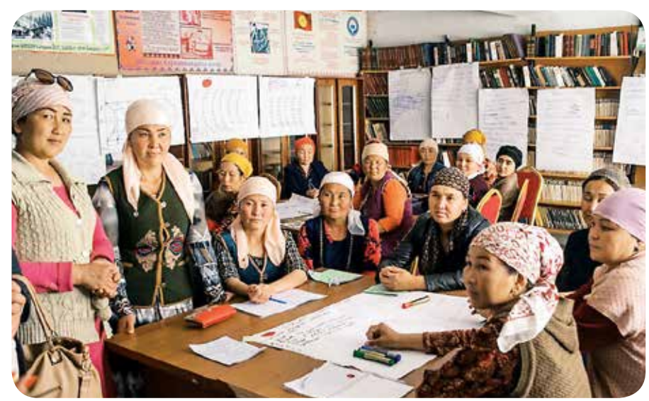
A major achievement of civil society organisations in Kyrgyzstan was the development of the Adult Education Concept that recognises that adult education requires official recognition to enable the implemention of a lifelong learning framework.

in the early 2000s in Kyrgyzstan an informal association of adult education providers began to form. Later, in 2006, with the support of