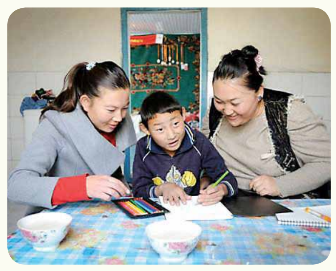
Mongolia introduced ground-breaking regulation on inclusive education of children with disabilities in regular schools, and instruction on providing support for children with disabilities.

The idea of inclusion has been promoted by international organisations and local NGOs since 2003, and led to a 2016 amendment of the Mongolian Education Law after adoption of the 'Law on the Rights of People with Disabilities'. The Ministry of Education has taken several steps towards inclusive education, especially ground-breaking regulation on inclusive education of children with disabilities in regular schools, and instruction on providing support for children with disabilities.