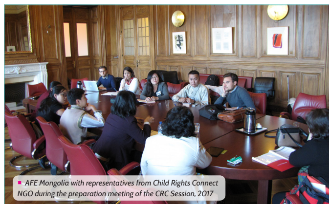
■ AFE Mongolia with representatives from Child Rights Connect NGO during the preparation meeting of the CRC Session, 2017

There are also special procedures involving Special Rapporteurs or Independent Experts, or a working group from the five UN regional groupings (Africa, Latin America and the Caribbean, Eastern Europe and the Western group) who are given mandate from the UN HRC to examine, monitor, advise, and publicly report the violations of civil, cultural, economic, political, and social rights. It oversees 44 thematic mandates among which are on the right to education, minorities issues, violence against women, persons with disabilities, and indigenous peoples; and country-specific mandates on human rights situation of the current 11 countries particularly Cambodia, Myanmar, Korea in the Asia Pacific.