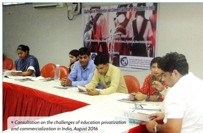
■ Consultation on the challenges of education privatization and commercialization in India, August 2016

The education coalitions in India and Pakistan also submitted parallel reports to the Human Rights Council (HRC) for the UPR of