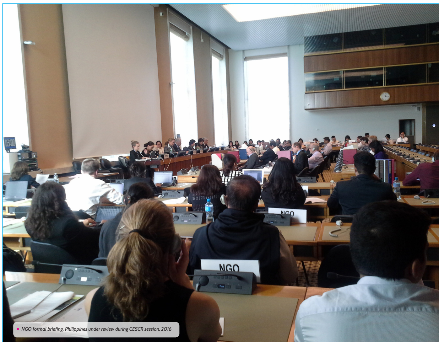
■ NGO formal briefing, Philippines under review during CESCR session, 2016

The findings and recommendations of the UN human rights bodies further elaborated the core principles of the right to education and provided clear guidelines on financing of education and the regulation of private actors in education to ensure equity and inclusion. Moreover, the set of recommendations provided a clear linkage to the ongoing engagements of civil society on the Sustainable Development Goals (SDG) and the Education 2030 Framework for Action.