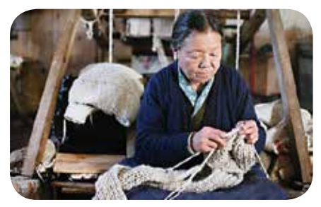
Re-skilling opportunities to enhance refugees' abilities to take on decent work in their host countries are essential for economic independence, restoring dignity for refugees, and to contribute to the local economy.

These regional and global civil society organisations of adult education offer ready platforms to share experiences and good practice in relevant and effective adult education responses and strategies for humanitarian and longer term responses to the refugee crises. They promote solidarity, people-to-people exchange, bridging cultural and other divides, and contributing to building a wider sense of global citizenship and a shared humanity among diverse groups and peoples of the world. They also offer broad fronts for civil society organisations to engage