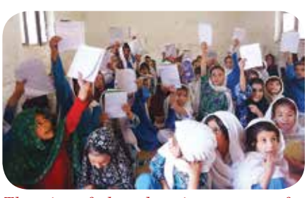
The aim of the education strategy for Afghan refugees in Pakistan is to provide primary education in refugee villages, including payment of teacher incentives, rehabilitation, upgrading of school facilities, and provision of school supplies.

Pakistan is not a party to the 1951 Convention relating to the Status of Refugees or its 1967 Protocol. At present, Pakistan has also not enacted a domestic legal framework for the protection of refugees and, consequently, has no domestic refugee status determination procedures or institutions in