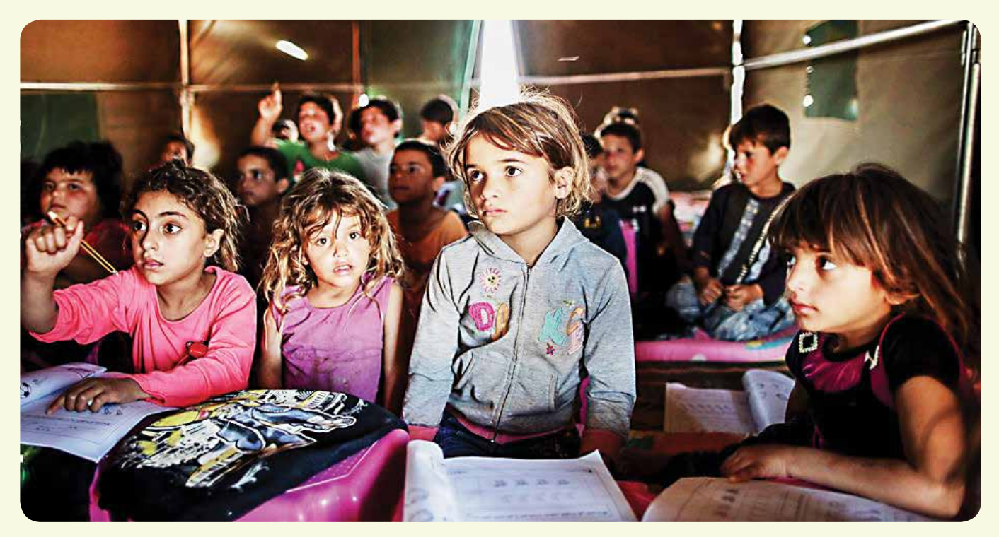
As stability is considered a pre-requisite for child-friendly education, war and displacement disrupts this steady and slow journey drawing education systems back many miles.