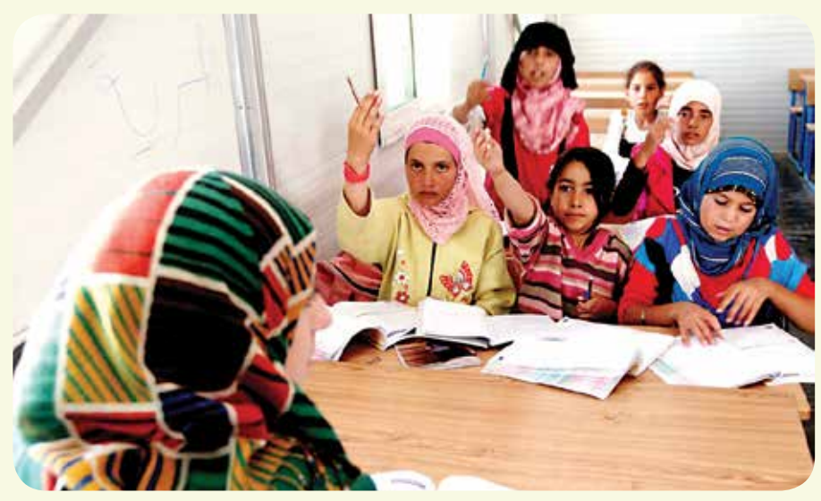
The right of Syrian refugee children to education has been pushed down the priority list due to more focus on other needs like food and shelter. This is combined with dwindling resources earmarked for education for emergencies.

response to the Syrian children education crisis does not mean that the Jordanian government has not reacted. There were attempts to expand schools into to double-shifts and classes were allowed to contain an enormous numbers of students. However, compared to the volume of international aid given, the barriers to access to education by Syrian children remain huge.