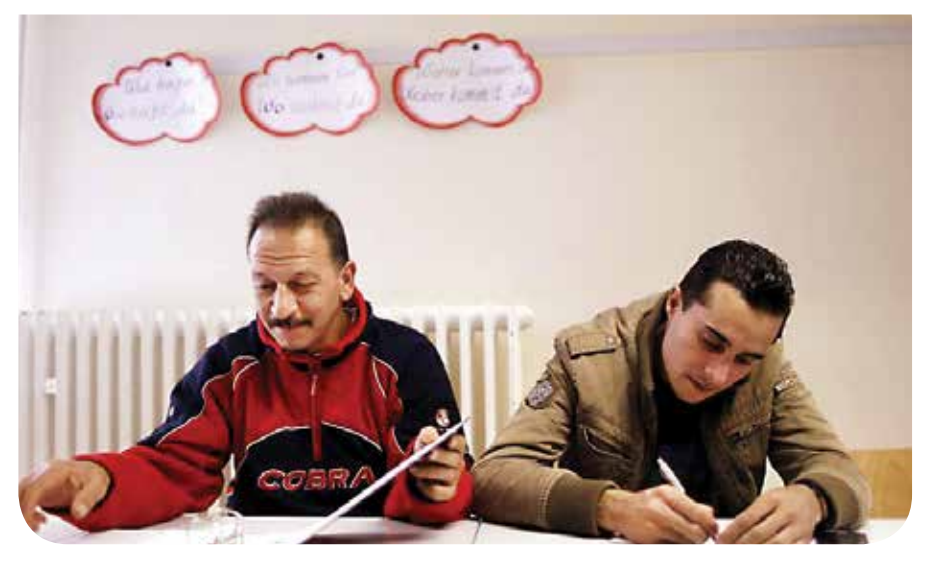
The German Adult Education system plays a key role in responding to the refugee 'crises'. A country with a professional, flexible, and well established lifelong learning system is able to react better to a challenge like this.