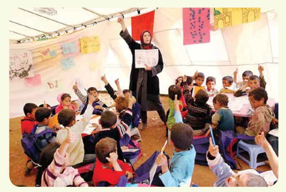
Compared to the volume of international aid given, the barriers to access to education by Syrian children remain huge.

In the year when the slogan for education is "increase spending on education", Syrian children are at a very long distance from post-2015 education goals. Education in crisis is not just an objective on its own but rather a cross cutting aspect for all education objectives.