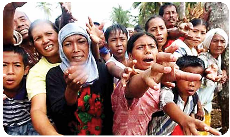
The world is experiencing an unprecedented rise in the numbers of refugees, forcing more people than at any other time since UNHCR records began to flee their homes and seek refuge and safety elsewhere.

The right to education is most at risk during emergencies, yet education is critical during emergencies, times of crisis and displacement. As argued by the Inter-Agency Network on Education in Emergencies, (INEE),