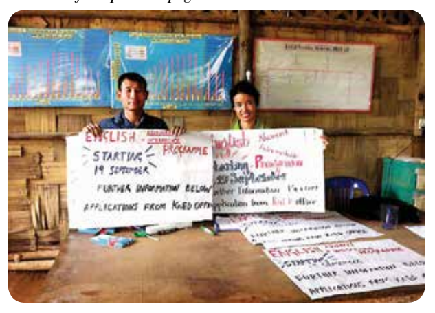
Adult education organisations offer platforms to share experiences and good practice in adult education responses and strategies for humanitarian responses to the refugee crises.

with information on their choices and rights are also essential, as are inter-cultural exchanges between new arrivals and host communities to foster better cross-cultural understanding, battle xenophobia, discrimination, and promote tolerance.