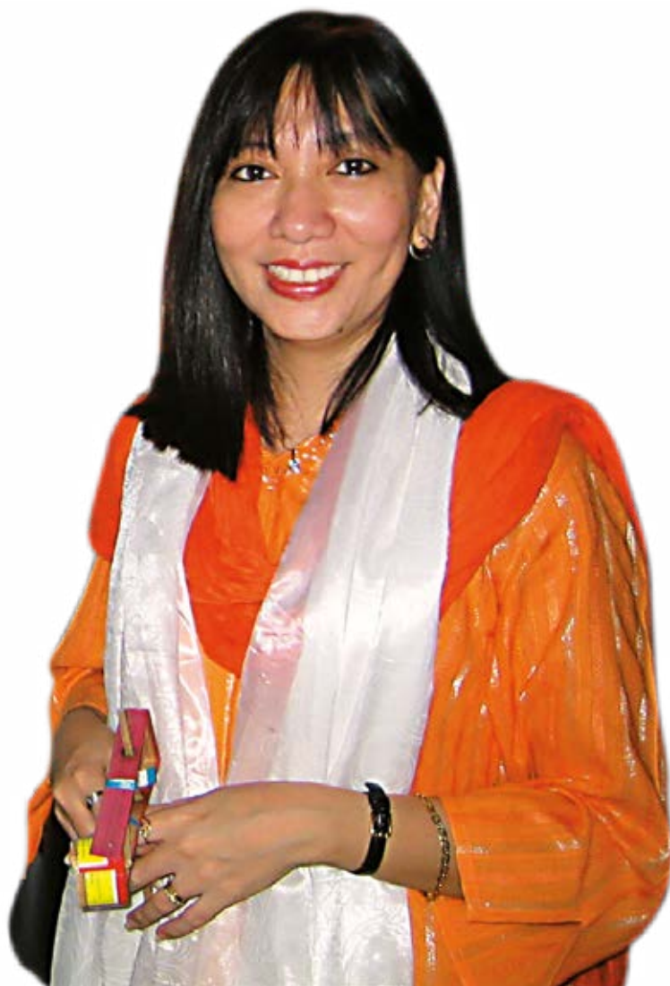
ASPBAE Festival of Learning, Yogyakarta, Indonesia (2004)