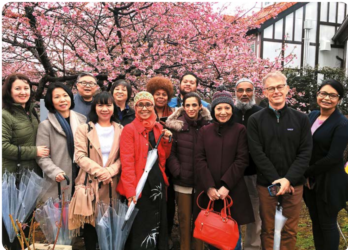
ASPBAE Executive Council and staff, Gotemba, Japan (2019)