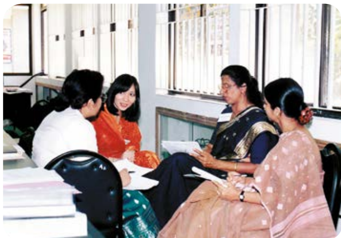
Dhaka, Bangladesh (1998)

reputation, charm and humour to influence people at a personal level and at the organisational level in terms of its decisions and processes.