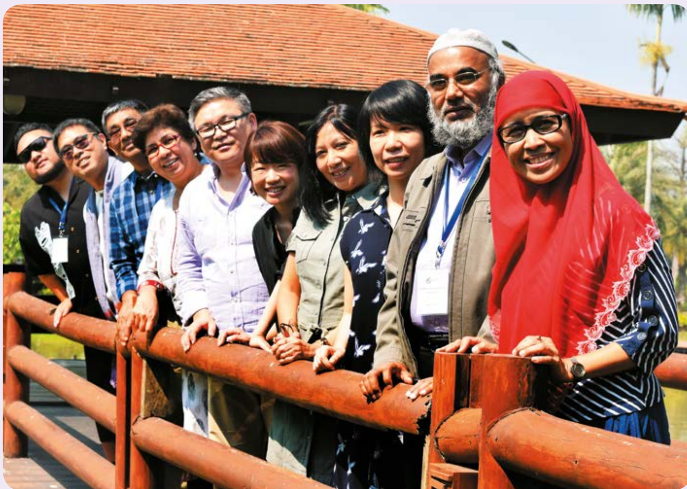
ASPBAE Executive Council, Chiang Mai, Thailand (2017)