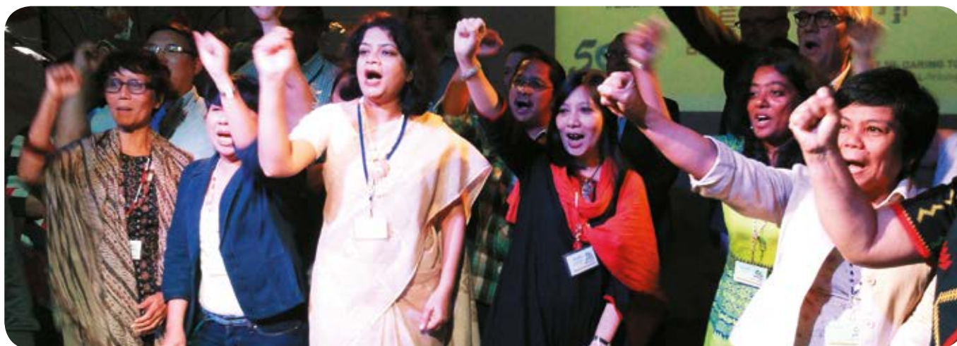
ASPBAE's 50th anniversary celebrations, Manila, Philippines (2014)