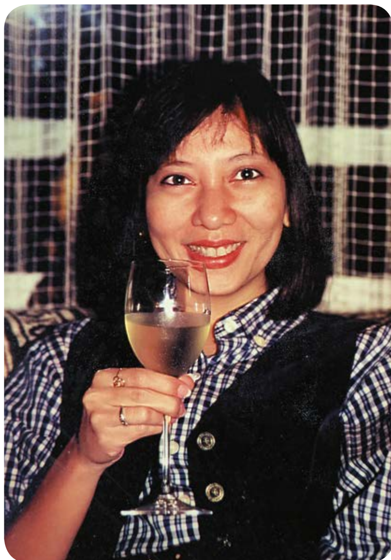
On travel in Bonn, Germany (1995)