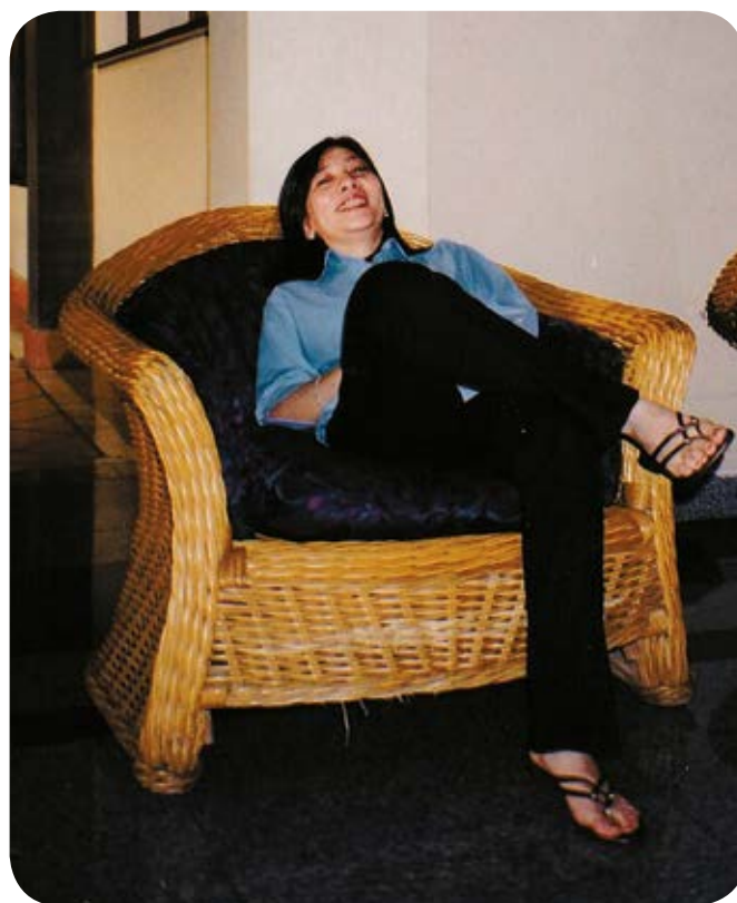
Finally time to sit back, relax, and enjoy the ride from here!

ASPBAE is a family of strong and kind members, and there is plenty of thanks and blessings to be uttered to a mighty woman who, as a Secretary-General, chose to eat lunch with an unknown young man. Actions always speak louder than words.