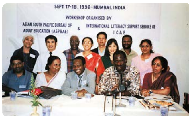
ASPBAE-ICAE workshop, Mumbai, India (1998)