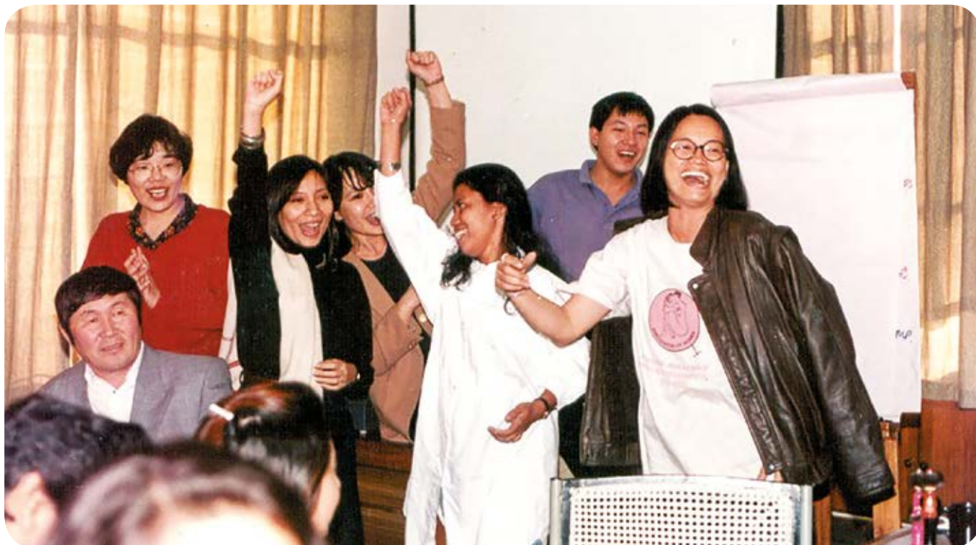
Basic Leadership Development Course (BLDC), New Delhi, India, 1995