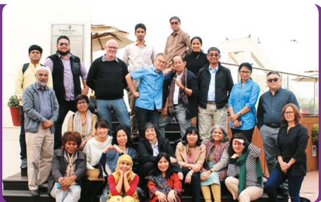
ASPBAE Executive Council and staff, Jaipur, India, 2018