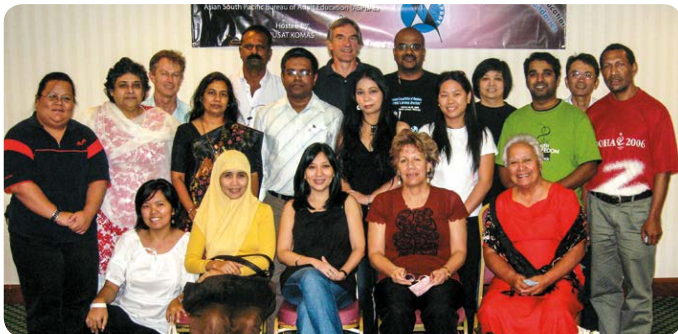
Executive Council meeting, Kuala Lumpur, Malaysia (2008)