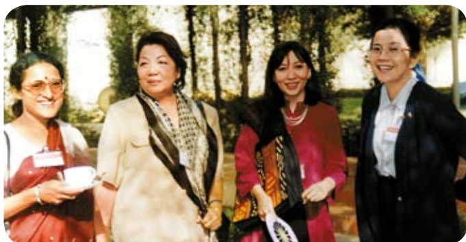
World Education Forum, Dakar, Senegal (2000)