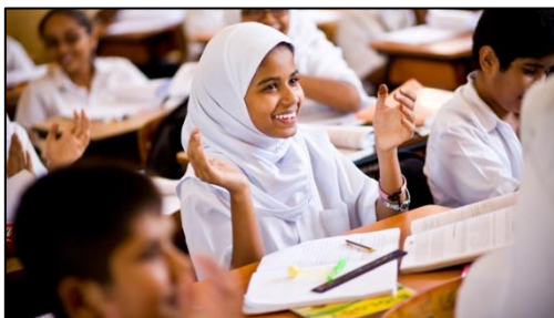
The agenda of the Finance and Risk Committee (FRC) meeting included a decision on the financial forecast for GPE, GPE Multiplier request for extension of the Maximum Country Allocations (MCA), 3 lines of defence model, and replenishment surge budget.

Concerns about the new Strategic Plan included a reluctance to listen to feedback on new areas/themes that need addressing; a dilution of the strong processes and conditions currently set that offer a greater handle to push governments to stronger public systems reforms; and some of GPE conditions and processes being portrayed as too heavy or cumbersome.