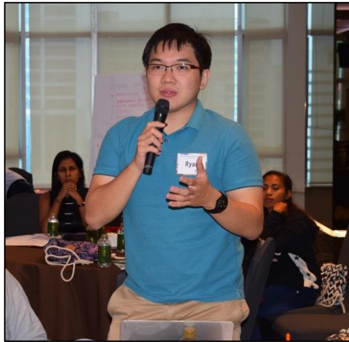
Participants proposed actions to strengthen the youth constituency in their respective organisations.

Participants proposed actions to strengthen the youth constituency in their respective organisations. Some of the strategies and activities included engaging youth in ASPBAE regional consultation meetings on SDG 4, strengthening the youth constituency and building capacities through regional and international meetings and youth forums, engaging youth in coalition and CSO campaigns and programmes, introducing a human rights perspective to advance the right of young people, using a feminist lens to conduct research, developing a youth educator's programme and organising a trilateral meeting with youth, government, and NGOs/CSOs, and amplifying youth voices from the national to the global level through youth direct participation in global spaces for policy, network and capacity-building..