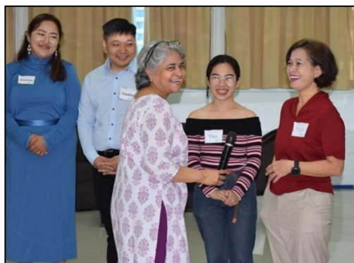
The learning exchange was a platform for exchange on the YAR experience.

To provide a platform for learning and exchange on the overall YAR experience to date, ASPBAE organised a YAR Learning Exchange that brought together 34 participants from the YAR participating countries.