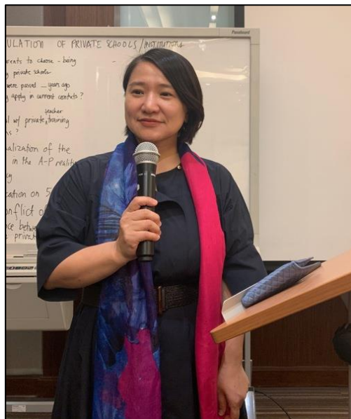
Various participants committed to using the Abidjan Principles as a reference in their lobbying for increased public budgets for education, stricter enforcement of regulations of private educational institutions, and the rising privatisation of education.

During the debates at the consultation, several recurring themes emerged such as the influence of private actors on governments, the inherent “conflict of interest” in politicians and authority figures in education policy and more broadly, being owners of large scale private educational institutions themselves. In these contexts, the use of public funds to finance and support private education becomes even more egregious.