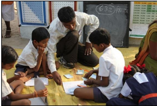
GEC committee members reiterated the need for fit-for-purpose governance structures to support GPE's new Strategic Plan.

Concerns about the new Strategic Plan included a reluctance to listen to feedback on new areas/themes that need addressing; a dilution of the strong processes and conditions currently set that offer a greater handle to push governments to stronger public systems reforms; and some of GPE conditions and processes being portrayed as too heavy or cumbersome.