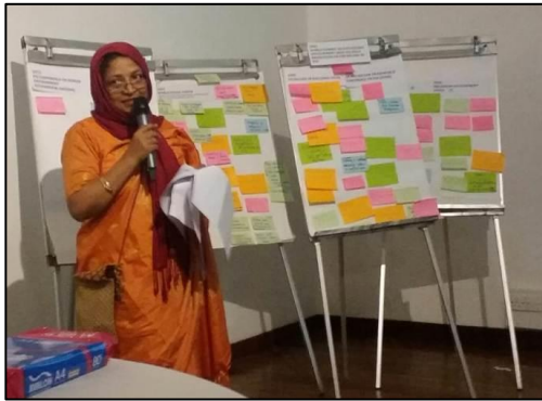
Participants from India the Philippines spoke about efforts to mainstream ESD in pilot schools and organising trainings for teachers on positive discipline, promoting respect for human rights and peace.

the Mayor of Negombo. The latter talked about peace building initiatives in the community after the Easter Bombings of April 2019 and sustainable practices in the city.