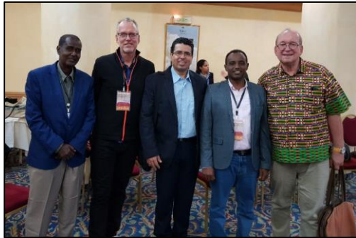
ACEA's General Assembly included a review of ACEA's major activities and accomplishments, strategising for its plan for 2020-2022., and Board elections.

towards a regional strategy for achieving SDG 4. The meeting included a review of the current role of the member coalitions – their experiences, success stories, and challenges they face - and the main focus areas of their future plans in 2020.