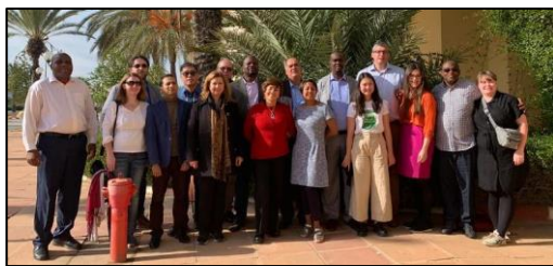
The Global Campaign for Education held its Board meeting in Tunisia following the 9 th Global CCNGO meeting.

Another key agenda item was a discussion about the development of a GCE youth strategy and youth engagement, which aims to enhance the representation and visibility of young people within the movement.