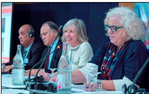
The CCNGO2019 meeting aimed to build on the experiences of civil society organisations and strong commitments to strengthen collective initiatives towards the realisation of the SDGs and education related targets.

The 9 th Global Meeting of the Collective Consultation of NGOs on Education 2030 (CCNGO2019) was organised by UNESCO in Hammamet and hosted by the Global Campaign for Education (GCE), alongside the Arab Campaign for Education for All (ACEA) and the National Association of the Right to Education (ANDET).