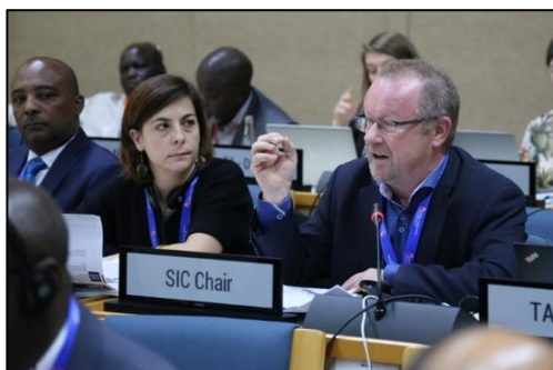
The Global Partnership for Education (GPE) Board of Directors met in Nairobi as the Partnership enters the final year of its 2020 strategic plan.