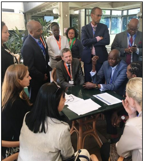
CSO2, UNESCO, Developing Country Partners (DCPs), and some donors argued for the financing to be aligned to the full SDG 4 agenda, prioritising the poor and marginalised, and based on country needs and contexts.

The CSO2 constituency expressed concern that SDG 4 adult education and adult literacy targets are being left out of funding in all global financing mechanisms to date.