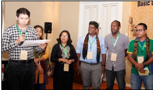
Interactive sessions were integrated in the BLDC to enable participants to share experiences and to learn from one other.