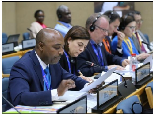
A substantial part of the GPE Board of Directors meeting was devoted to agreeing the steer to start developing the next strategy for the succeeding five years.

The Board meeting took place within the background of GCE's 20 th Anniversary that was celebrated during the CCNGO meeting preceding the Board Meeting. [BACK]