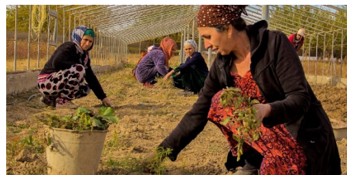
Civil society recommendations emerging from the meeting focused on participation, equity and inclusion, quality, policies and legislation, and financing and governance.