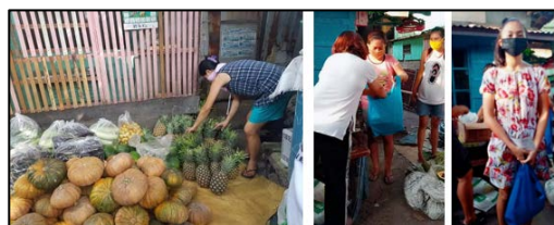
Youth groups in the Philippines connected with allied organisations and institutions for support such as food relief, medical supplies, and other essential goods.

For example, youth groups in the Philippines acted promptly, connecting with allied organisations and institutions for support such as food relief, medical supplies, and other essential goods. Youth groups coordinated with various organisations for community cleaning and disinfection efforts. Although government departments started food distributions, it was slow and limited. Therefore, the youth initiated a donation drive. They managed to distribute food packs to many poor families until the food relief assistance from the government was regularised. They also mobilised other youth volunteers to help in their awareness-raising campaigns. With the help of creative posters, they shared accurate information about the COVID-19 virus and ways to prevent it. This helped many families address their anxieties and practice proper health protocols. The youth teams also organised many virtual exchanges and webinars to advance these conversations.