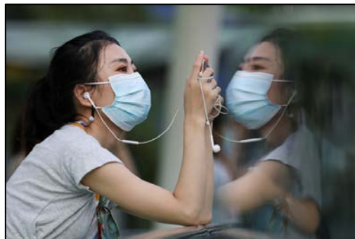
Young people continue to face significant disruptions and changes due to COVID-19 on multiple fronts - at home, in their schools, communities, and workplaces where their present and future seem to be under threat.