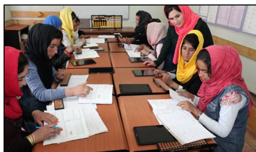
CSO recommendations called for access to ICT for all, including the elderly population; improving the quality of online Adult Learning and Education (ALE); and establishing partnerships with CSOs and local governments to expand ALE.