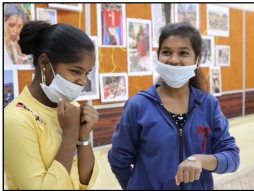
Abhivyakti Media for Development, AMD (India) organised a workshop for young researchers to brainstorm on developing tools and training materials for the Youth-led Action Research (YAR) e-manual.