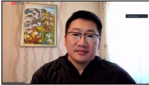
The new ASPBAE Executive Council for 2021-2024 was introduced in the first day of the Strategic Planning Workshop.