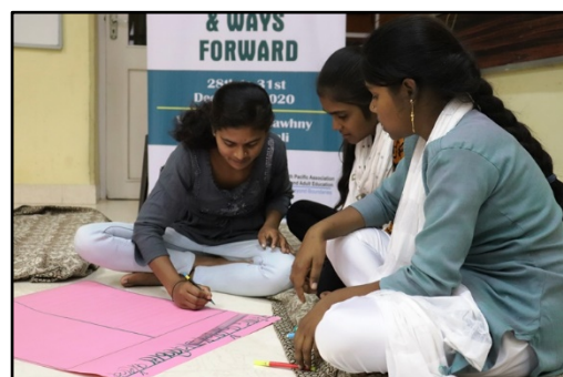
Participants discussed the important role of training and capacity building in the evolution of the role of the researchers and brainstormed on ways the skill building can be further developed and enhanced.

The YAR has been a process of transformation for those who have been a part of it. Participants shared the change it has brought to their lives. In the workshop, they discussed how and why the transformation happened, what the process was, what helped and what didn't. Participants drew a process tree where they indicated the milestones of the transformation process. They discussed the important role of training and capacity building in the evolution of the role of the researchers and brainstormed on ways the skill building can be further developed and enhanced for the next generation of researchers.