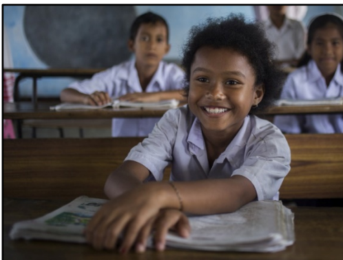
The CSO2 constituency recommended maintaining and upholding the existing governance mechanisms in GPE which draws on the strengths of constituencies to support the Partnership.

The CSO2 Constituency emphasised that GPE's financing schemes should not reinforce indebtedness of countries and recommended GPE work closely with developing country partners to support strategic and informed discussions to address key issues affecting education budgets, including action to expand tax revenues and address debt.