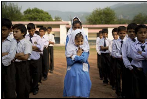
The Board recommended, amongst others, hardwiring gender equality throughout the GPE 2021-2025 strategy.

The CSO2 Constituency emphasised that GPE's financing schemes should not reinforce indebtedness of countries and recommended GPE work closely with developing country partners to support strategic and informed discussions to address key issues affecting education budgets, including action to expand tax revenues and address debt.