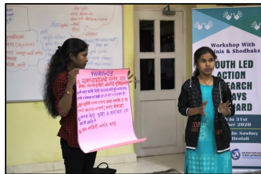
Participants highlighted several important tools and training materials to take the YAR forward such as addressing the challenges posed by patriarchy, and community mapping exercises for effective data collection, amongst others.

The YAR - Youth-led Action Research - is a platform to learn, change and to sustain by doing and experiencing. The YAR plant, planted 5 years ago, with support from ASPBAE, has now grown in many ways and with many dimensions. More and more shodhini 's (young women researchers), through their stories of sorrow, stories of happiness, experiments of and experiments for transformation, success and failures have taught us a lot in this journey. But this journey of transformation is unending and to keep it flowing there is a need to develop widely replicable models. ASPBAE, therefore, initiated the development of a YAR e-manual for those wanting to replicate the process for their own communities. The process included reaching out to YAR partners to contribute to developing the training material.