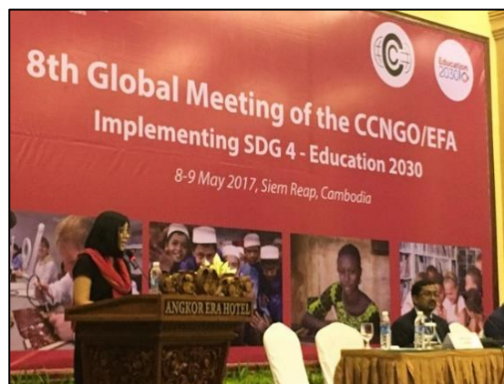
The 8 th Global Meeting of the CCNGO/EFA reflected on where civil society stands 18 months after the adoption of the global education agenda.